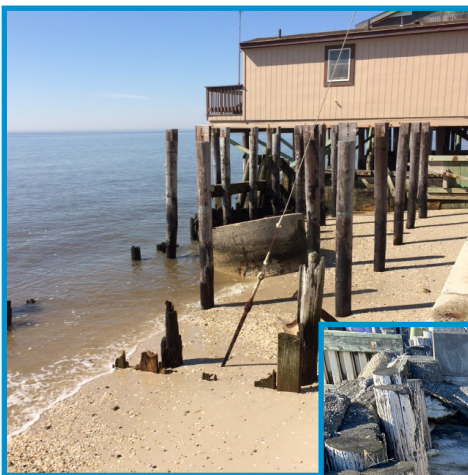
Section 2 at the northern end of the beach.