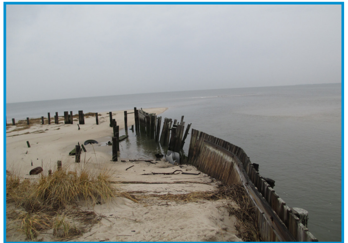
Derelict bulkhead at the end of Section 4.

■ Section 5- 0.30 km: Raybins Beach is owned by the Natural Lands Trust and NJDEP. Primarily a sandy beach with overturned crabs, but the bulk head at the house near the creek mouth is included in this section.