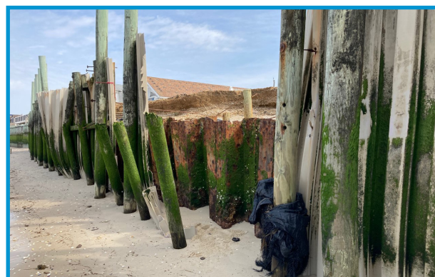
Hazards near Heritage Bayfront Camping Resort