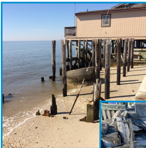
Section 2 at the northern end of the beach.