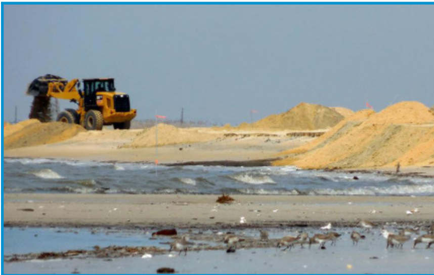
Kimbles Beach during 2014 restoration

Known impingement hazards: There are sections of marsh stubble and peat banks on both ends of the beach.