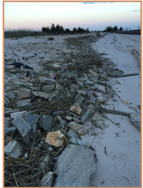
Exposed rubble on the high tide line where the road ends at the beach.

Note: There are multiple ways to get to Thompsons Beach. These directions are the easiest for people new to the area, but you will see signs on NJ-47 for other routes to Thompsons Beach. Ignore those signs if you are following these directions.