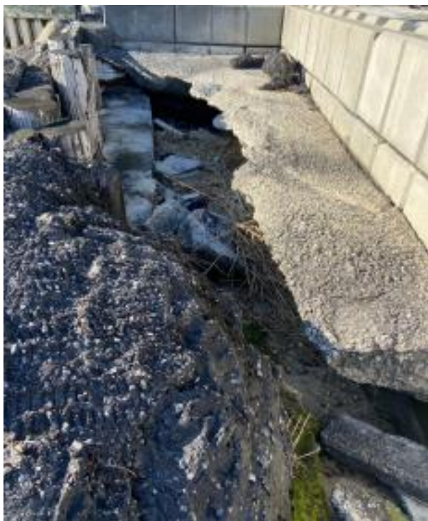
Beginning of the rip rap wall in Section 4, where the gap can trap many crabs.