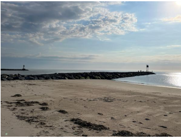
Jetty at the south end of Section 3 at the Cape May Canal.