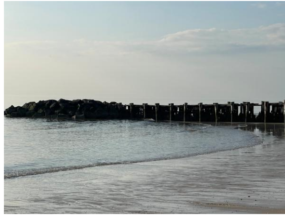
One on the many groins constructed of rock and wood.