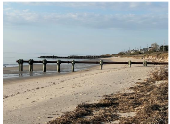
One of the many outfall pipes along the beach.