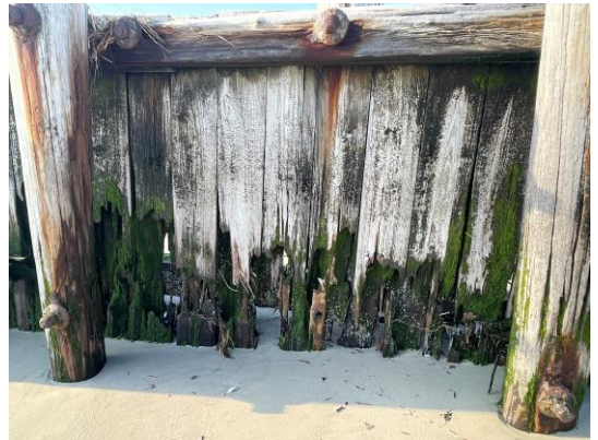
Closeup of wooden structure of groin where crabs can get trapped.

Street Parking: There is beach access at every street end along Beach Drive and street parking is available.