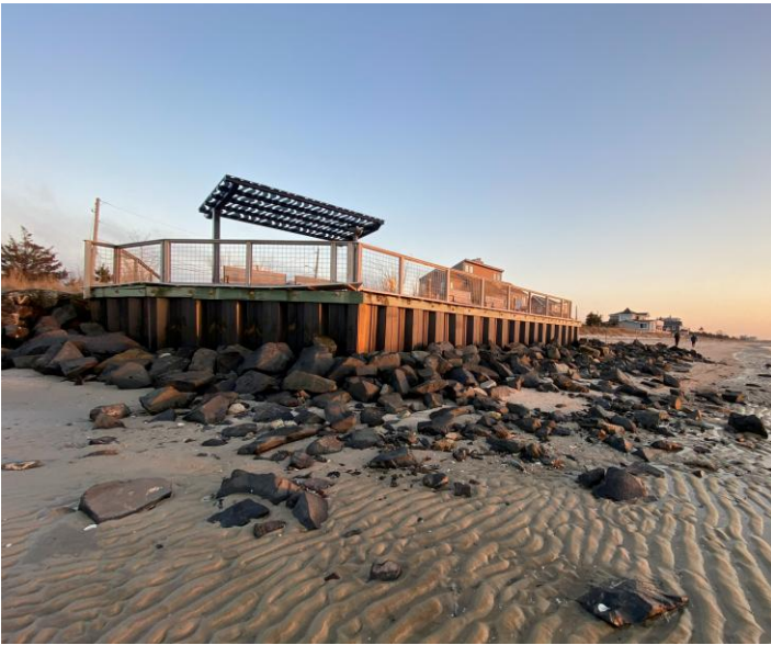
Bin blocks/riprap surrounding Norbury's Landing.