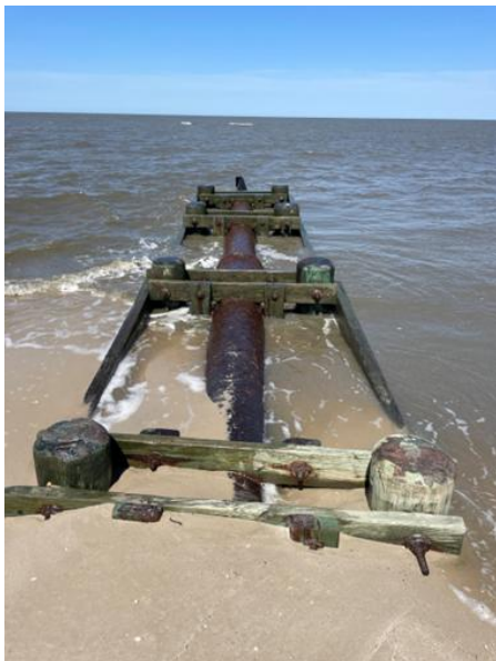
Outfall pipe on Villas Beach.