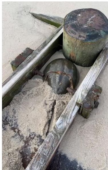
Crab stuck in wooden structure of outfall pipe.