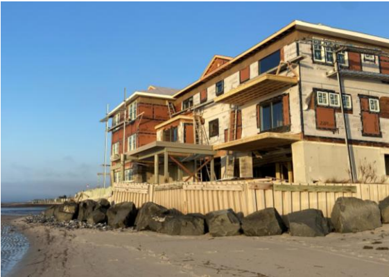
Bin blocks/riprap surrounding house.