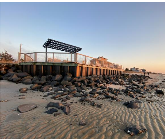
Bin blocks/riprap surrounding Norbury's Landing.